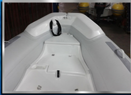
DL17 bow step