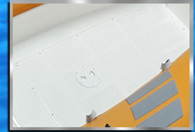
UB17&UB19 under deck fuel tank