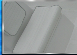
DL17 console's front seat