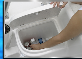
DL17 ice box